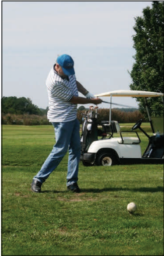
Linking District Employees Together