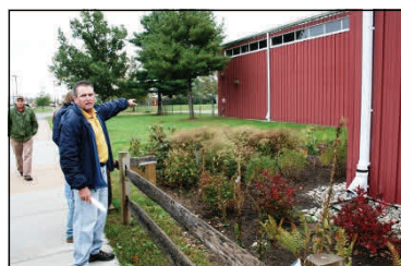
Rain gardens at Ag Museum