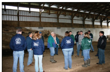
Spence Farm manure structure