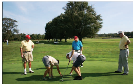
The winning team from NCCD at the putting contest