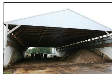
New design with concrete walls