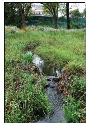
Adopt-A-Wetland site at Puncheon Run