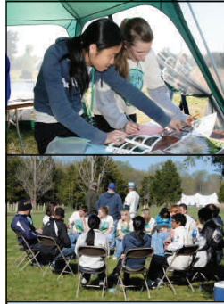
Many District employees assist at the annual Delaware Envirothon competition