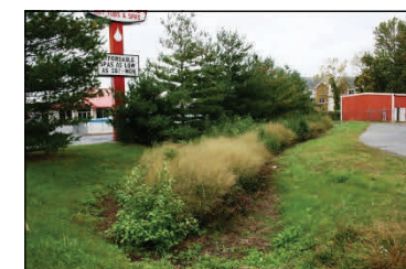
Bio-filtration pond at Museum