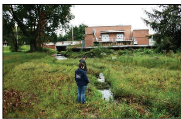
Plant plugs in restored channel