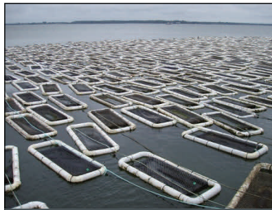
A view of the oyster farm operated by Marinetics, Inc.

The Horn Point Oyster Hatchery is one of the largest on the East Coast. It produces a variety of oyster larvae for use in research, restoration, and education.