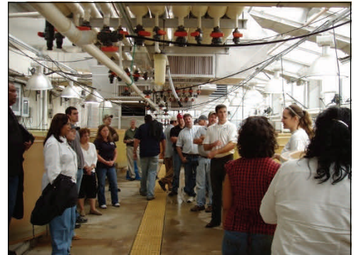
Pocomoke Chapter members take a tour of Horn Point Oyster Hatchery operation