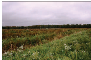
Jester Farm CREP project