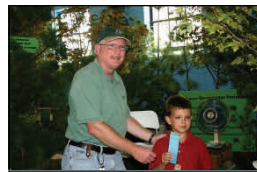
Many work at the State Fair exhibit each summer